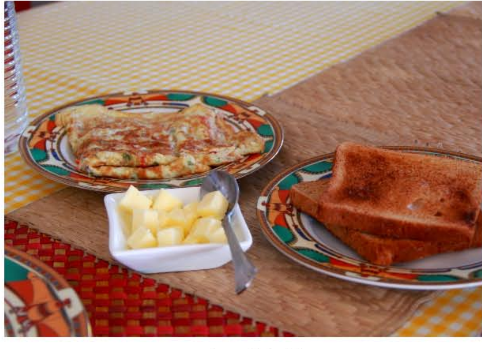
Homemade hot breakfast

He then shares that how White Peaks ensures that no wood is cut from the forest. Instead of making a new house, this one was bought from previous owners thus reducing another dent on the beautiful canvas called Kumaon.