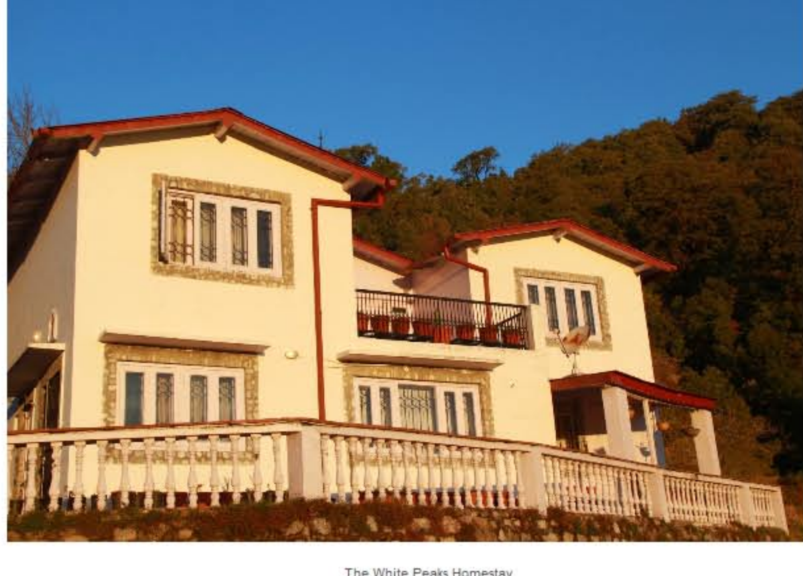
The White Peaks Homestay

With eyes half closed, I lay on my bed early morning watching the rays of sun slowly change colours from blue to orange to yellow and then white. From the cracks in the white curtains, the rays stream on my bed. I wake up to the fresh air and look at the red Rhododendrons blossoming in the balcony. And that's how I start my cozy little affair with the White Peaks Homestay .