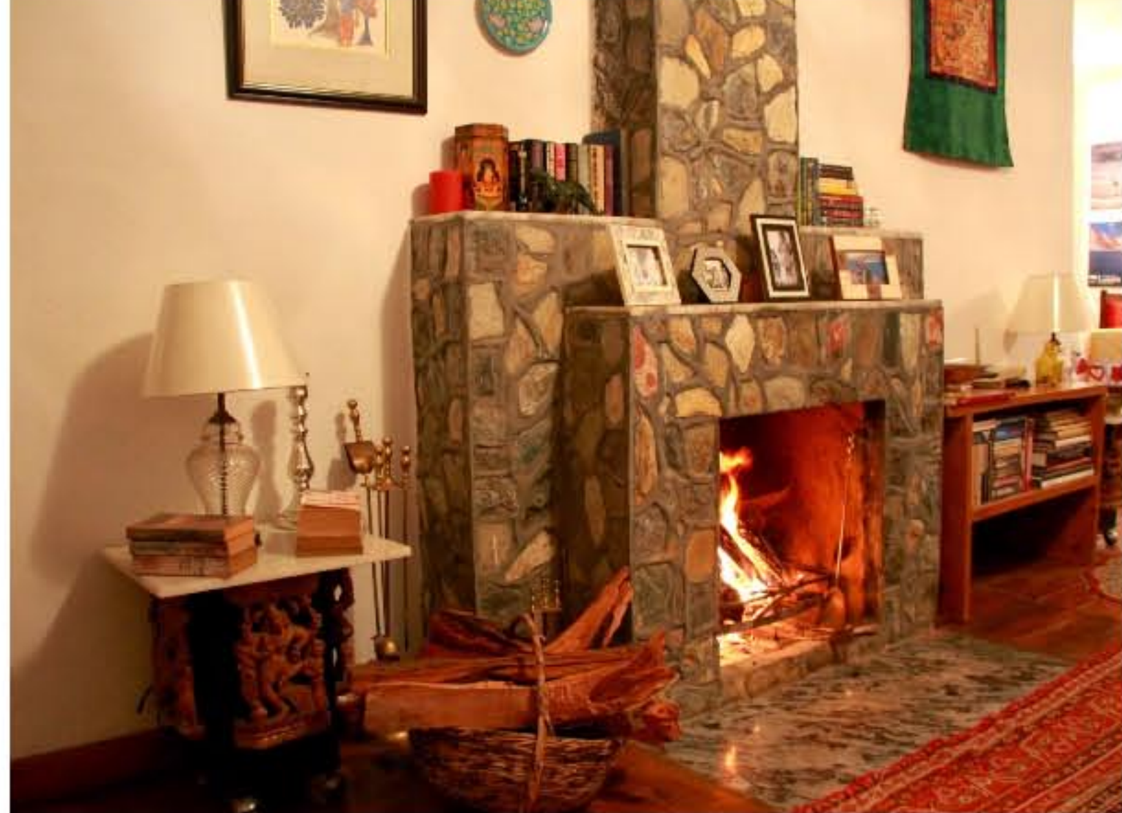
The cozy fireplace

I travelled to Gagar to explore The White Peaks. Usually, I have the urge to venture out during the day and explore nearby areas whenever I travel. But this time, I wanted to relax all day, put my feet up and sip wine in front of the fireplace.