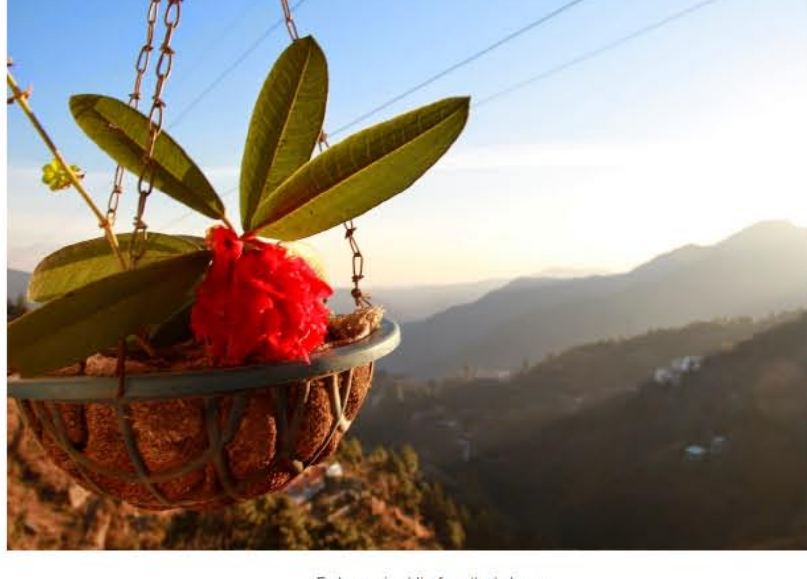
Early morning bliss from the balcony

After all the noise of Delhi and that of driving, it is a bliss to stand in the balcony with eyes closed and feel the orchards in the valley below and listen to the sounds of birds. Kumaon is indeed beautiful. The snow covered Panchchuli mountain range and Nanda Devi peak is visible far off as if calling me to it.