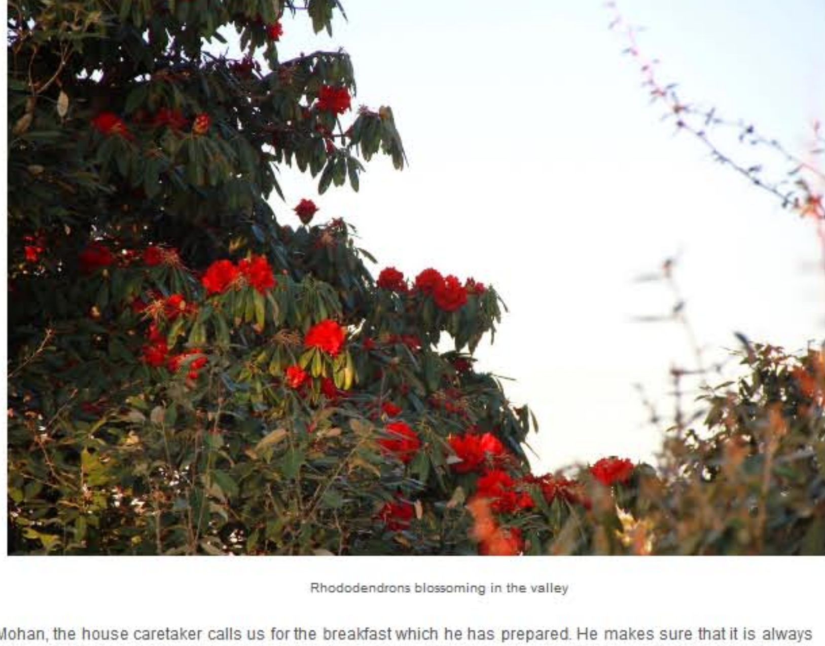
Rhododendrons blossoming in the valley